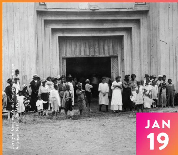
Library of Congress Prints and Photographs Division American National and Great Migration