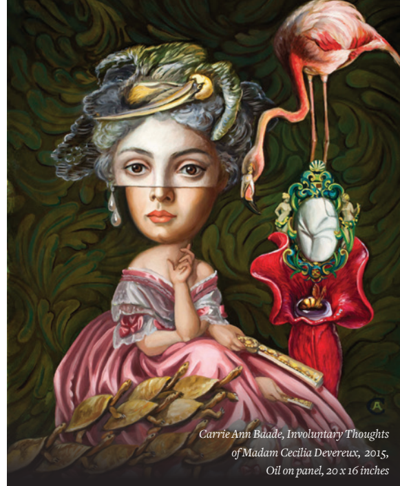
Carrie Ann Baade, Involuntary Thoughts of Madam Cecilia Devereux , 2015, Oil on panel, 20 x 16 inches

*Closing at 8PM Feb. 9 for a special ticketed event.