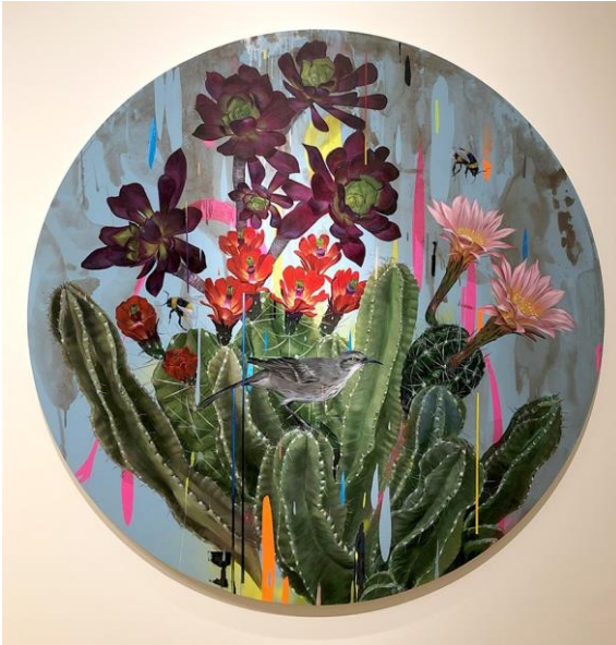
Frank Gonzales, (Tempe, AZ) Melodrama , 2019 Acrylic on canvas, 72 inches in diameter https://frankgonzales.net/home.html