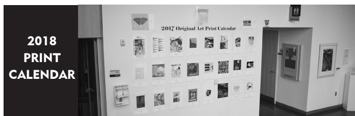
Lobby display of 2017 Original Art Print Calendar.