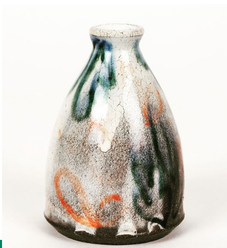
40 WAYS TO PLAY WITH SLIP BEGINNING TO ADVANCED