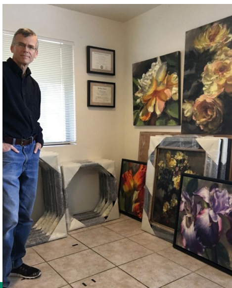
PAINTING STILL LIFE AND FLOWERS IN OIL KURT IN STUDIO