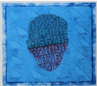
RON BRIMROSE - COLLAGRAPH