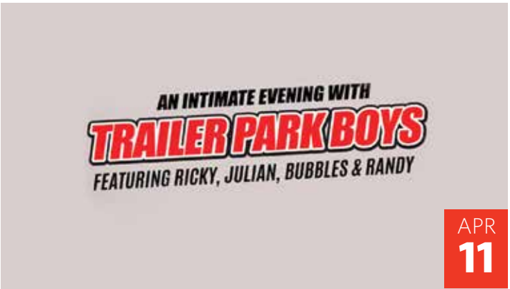
AN INTIMATE EVENING WITH TRAILER PARK BOYS FEATURING RICKY, JULIAN, BUBBLES & RANDY Apr. 11, 2018 • 7:30 p.m. | Ikeda Theater | $34.50-$59.50 Trailer Park Boys are Canada's most beloved miscreants from a small town in Nova Scotia, Canada. Robb Wells (Ricky), John Paul Tremblay (Julian) and Bubbles (Mike Smith) have created loyal and loveable characters on their television series and their message has spread globally. Presented in partnership with Emporium Presents.