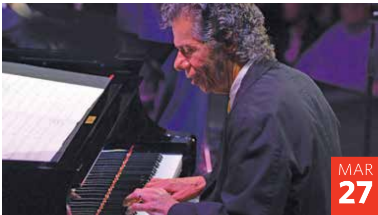
JAZZ AT LINCOLN CENTER ORCHESTRA WITH CHICK COREA Mar. 27, 2018 • 7:30 p.m. | Ikeda Theater | $52-$79 Pianist and composer Chick Corea joins the Jazz at Lincoln Center Orchestra (JLCO)—a group he calls “the greatest big band on the planet”—to perform transformative new iterations of his music. See why Corea and the members of the JLCO are considered some of the greatest jazz improvisers alive.