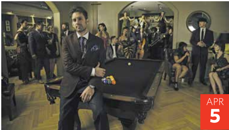
SCOTT BRADLEE'S POSTMODERN JUKEBOX Apr. 5, 2018 • 7:30 p.m. | Ikeda Theater | $42.50-$108 Postmodern Jukebox returns to Mesa Arts Center! Since Bradlee created PMJ in 2009, he has amassed more than 850 million YouTube views and 3 million subscribers, chalked up more than 1 million likes on Facebook, performed on “Good Morning America,” topped iTunes and Billboard charts, caught the attention of NPR Music and NBC News, and played hundreds of shows to sold-out houses around the world.