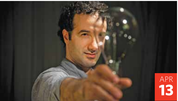
HOST OF PUBLIC RADIO'S RADIOLAB: JAD ABUMRAD EMBRACING THE GUT CHURN Apr. 13, 2018 • 8:00 p.m. | Ikeda Theater | $24-$35 While at WNYC, MacArthur fellow Abumrad began tinkering with an idea for a new kind of radio program. The idea evolved into one of public radio's most popular shows today – RadioLab . Spend an evening with him exploring “Gut Churn” and what it's like navigating feelings during the creative process.