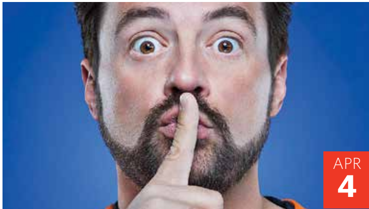
AN EVENING WITH KEVIN SMITH Apr. 4, 2018 • 7:30 p.m. | Ikeda Theater | $35-$45 An Evening with Kevin Smith is a chance to get up close and personal with the man who brought the world Clerks , Chasing Amy , Dogma and Jay & Silent Bob Strike Back .