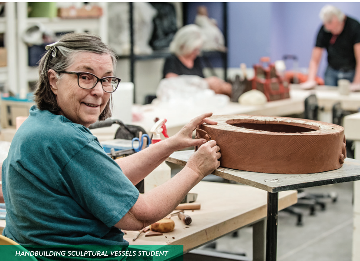
HANDBUILDING SCULPTURAL VESSELS STUDENT