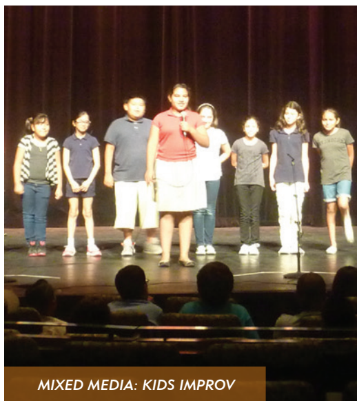
MIXED MEDIA: KIDS IMPROV

NOV 3, 2018 - DEC 15, 2018 / SAT / 7 WEEKS 10:00 AM - 11:00 AM / AGES: 8-14 / $65 INSTRUCTOR: MARIO MENDOZA CYF18ACTMM001-11