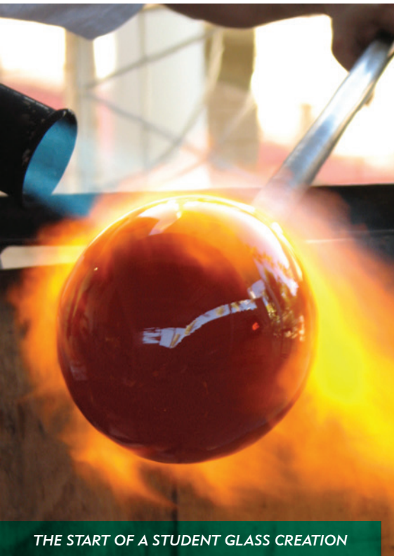
THE START OF A STUDENT GLASS CREATION

NO CLASS SEPT 3, SEPT 7 / *PRE-REQUISITE D