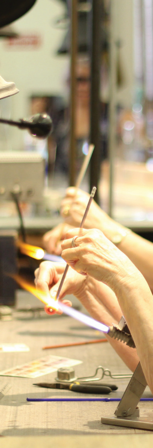
MAKING GLASS BEADS WITH FLAMEWORKING