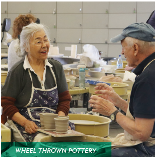
WHEEL THROWN POTTERY